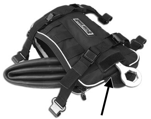
There is also a top pocket that is great for a tire iron. Always make sure when you remove contents from any of the pockets, the bag will need to be re-adjusted or tightened. This bag was designed to hold up to 1 inner tubes and 2 tire irons. Maximum carrying capacity is 5lbs.