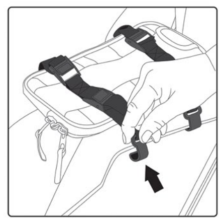
Place bag on front fender. Align so that the bag will not interfere with any moving part of the bike. Place the hooks around the edge of the fender. It might be necessary to remove some of the slack in the strap to move the hook closer to the fender.

Please read instructions carefully before installation. We recommend this product be installed by a qualified and experienced technician. If you are unsure of any of the below directions and or your ability to correctly and securely install this product, please contact us or your local dealer for help. Below diagrams show typical installation. Your vehicle may be different so please use diagrams as a guide. Make sure your vehicle is clean and free from dirt, road grime, etc. where the this product mounts. It is the riders responsibility to make sure the product is mounted and secure before each use. Loading the bag may result in a change of position, always check for proper mounting position after loading and before each and every ride.