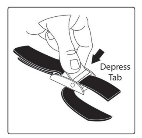
Pass the end of the strap through the cam buckle by pressing down on the aluminum tab and passing the strap through the back of the buckle and pulling tight.