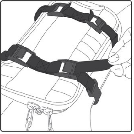
Once in position, pull the strap through the cam buckle until tight. Repeat on all 4 hooks and straps. As an alternative you can attach the bag to the fork tubes to help prevent the bag from sliding down the fender.